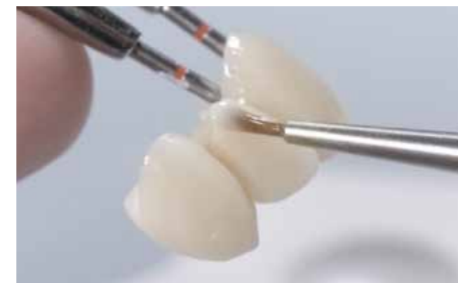
Crème Universal Stain enhances the incisal aspect in this Celtra Press 3-unit anterior bridge.