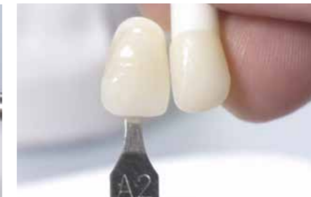
High Flu Universal Overglaze enhances a quick and easy shade reproduction in a monolithic Cercon xt crown.

Easy-to-follow staining recipe guides for Celtra Duo, Celtra Press, Cercon ht, and Cercon xt are available at dentsplysirona.com/ceramics .