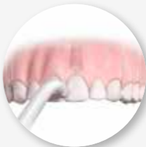
2. End-tufted brush (interspace brush)