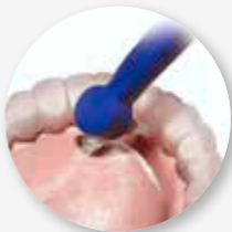
2. End-tufted brush (interspace brush)