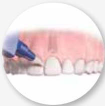
3. Interdental brush (inter proximal brush)