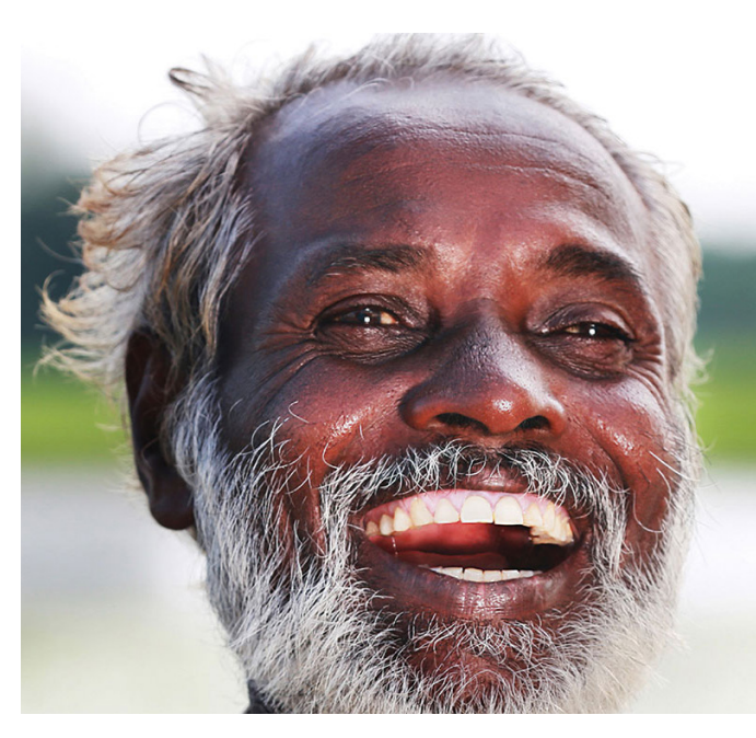
Increasted access to endodontic care.

Project 32 provides clinical education for training local dentists to perform a successful root canal treatment using the single-patient kit. Our comprehensive, hands-on course takes participants step-by-step through the efficient procedure, so they can bring healthy outcomes