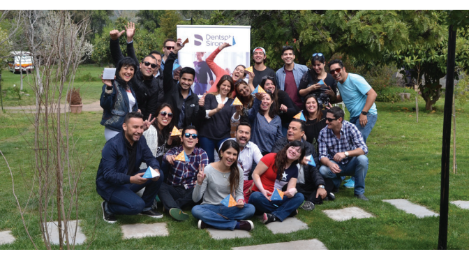
Dentsply Sirona colleagues in Chile gather with the Company's values pyramids to display one global team bringing out the best in each other.