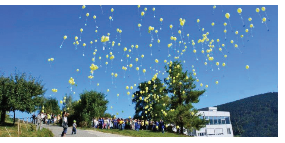
Balloon releasing with community members at the Ballaigues, Switzerland Dentsply Sirona office during an event supporting local children with cancer.