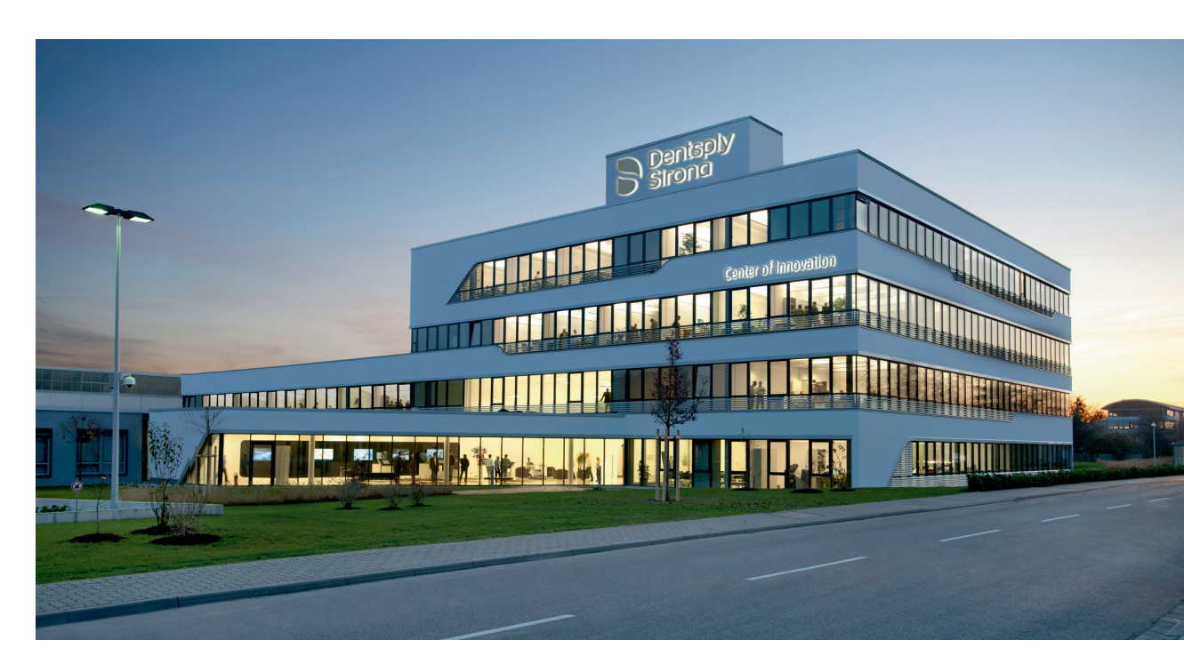
The Dentsply Sirona Bensheim facility in Germany, home to where many ISO certifications are in use.

The NLF/ILO-OSH 2001 guidelines are a set of safety measures that have been developed by the International Labor Organization (ILO) and are a set of safety measures put in place to reduce the hazards and risks in the workplace. Our goal is to provide a safe and risk-free environment for our employees to thrive.