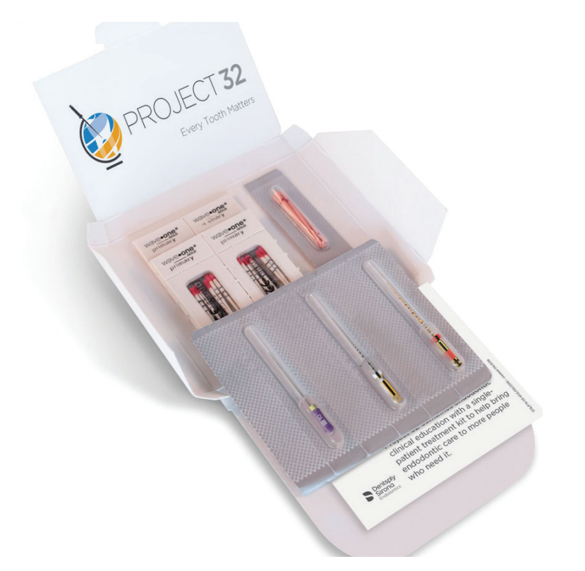
The single-patient treatment kit for Project 32 created by Dentsply Sirona Endodontics.

arthritis, pulmonary diseases, and cancer.