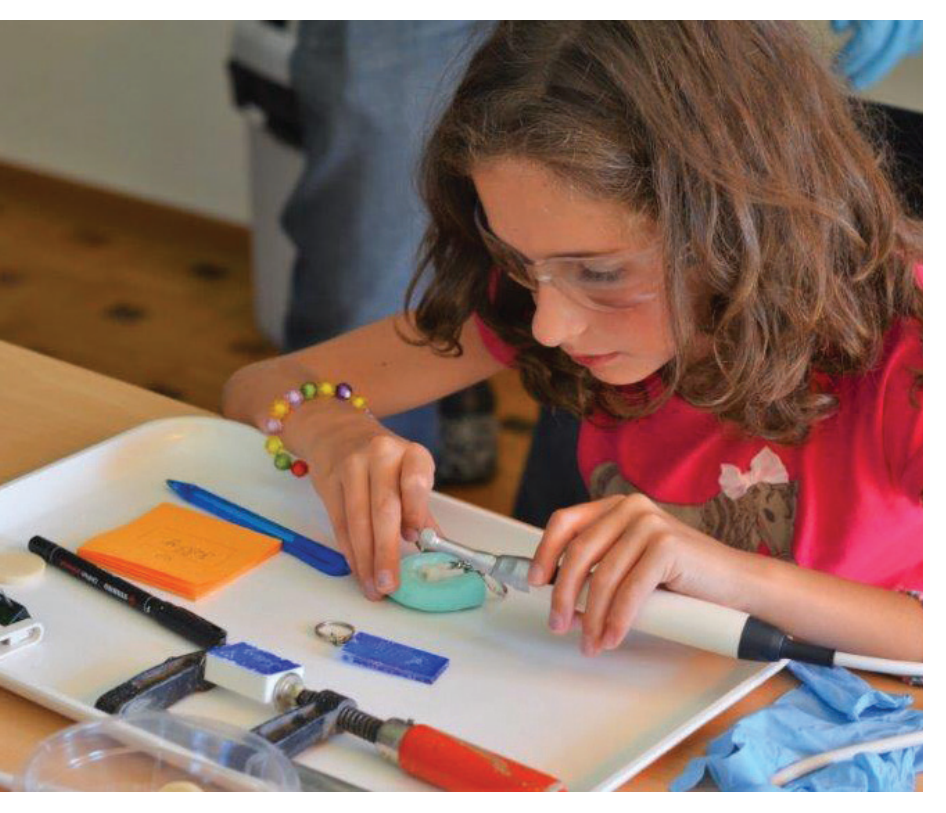
Through ARFAC Association and Dentsply Sirona, local Jungfrau, Switzerland children enjoyed hands-on activities with Dentsply Sirona, including engraving keychains alongside R&D employees with a Dentsply Sirona Thermafil-Endo-Training block and X-Smart Plus hand instrument.

Sirona actively participates by purchasing gifts from a "wish list" and taking them to Eugene Field Elementary for the children to open during their classroom party. The Endodontic business in Tulsa has been a part of this project for over 10 years and still finds joy and excitement each year they participate. Being able to provide children with gifts to open during the holidays is something the entire team looks forward to every holiday season. All gifts are equal, so no child receives more than another. All of the children are treated with love and respect, and because of that, they know Dentsply Sirona truly want to share the holiday spirit with all of them.