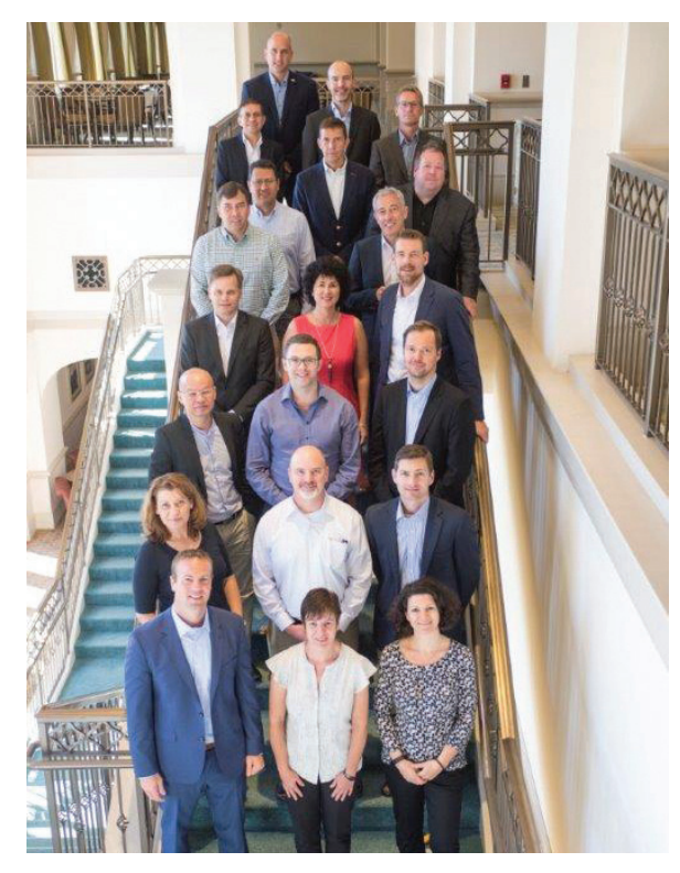
The 2016 Dentsply Sirona Global Leadership Development participants.

Our employees thrive on collaboration with a global team of colleagues, and the opportunity to make a difference in our mission to provide better, safer, faster dental care. We offer a broad range of exciting and rewarding opportunities across the globe. The Dentsply Sirona team is worldwide, diverse, engaged, and passionate about dentistry. From sales and marketing, to clinical education, or research and development, our people actively