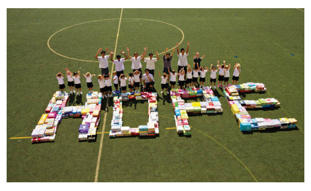
The Box of Hope organization, alongside volunteers bring hope into action for those less fortunate.

This program demonstrates our core mission and values by delivering innovative dental solutions to improve oral health worldwide. The patients of the program do not have access to advanced dental solutions in their local dental facilities. By