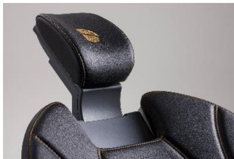
Fig. 2: The innovative motoric headrest – made of high-grade German steel.