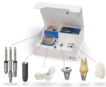
Fig. 1: Azento™ Box.

are available for > Download on the website.