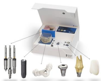
Fig. 1: Azento™ Box.

are available for > Download on the website.