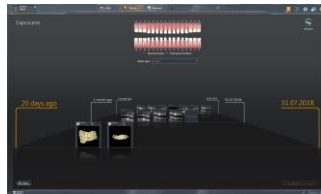
Fig. 2: Imported STL files in the Sidexis 4 V 4.3 timeline view