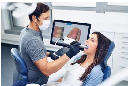
Fig. 1: Primescan is the new intraoral scanner from Dentsply Sirona that takes digital impressions to the next level of quality.

are available for > Download on the website.