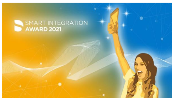
Fig. 8 The Smart Integration Award was presented for the second time in 2021. The applicants came from nearly 40 countries.