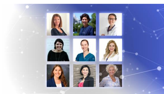
Fig. 4: Nine talented women were honored in the Digital Clinical Workflow category.