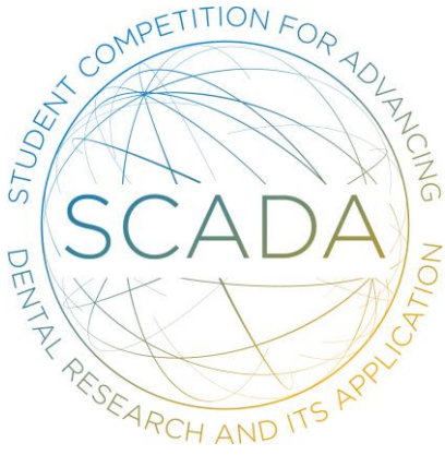
Fig. 3: SCADA-Logo