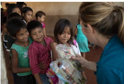
Fig. 3: Children were given a set of dental care instruments and waited patiently for their own little pack.