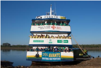
Fig. 1: Doutores Sem Fronteiras traveling in Amazonia. The 120-strong team started the DSF expedition 2018 on this boat, traveled and treated a total of 1.096 patients on this boat.

are available for > Download on the website.