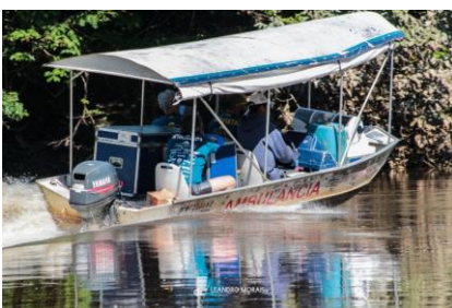
Fig. 5: Mobility thanks to compact CEREC equipment.