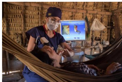
Fig. 4: CEREC functions in the most basic environments.