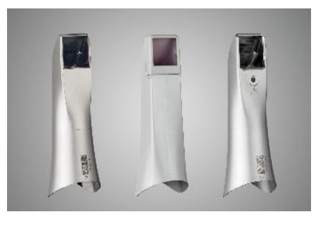
Fig. 2: Three different sleeve options for each of your hygiene needs, to ensure safe intraoral scanning. New to the family: The autoclavable stainless-steel sleeve with disposable window (right).