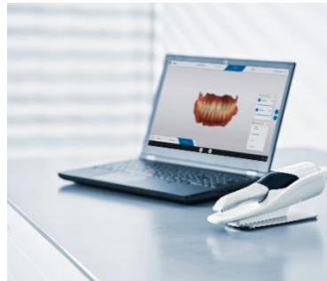
Fig 2: Primescan Connect