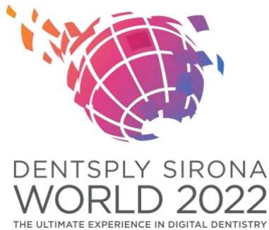
Fig. 1: DS World 2022 was held from September 15th to 17th at Caesars Forum in Las Vegas, NV.

are available for > Download on the website.