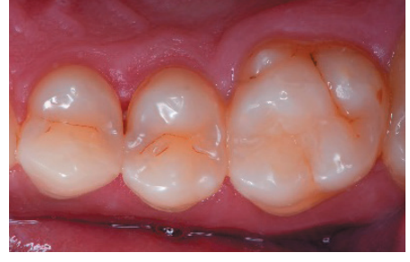
14. 2 weeks control.