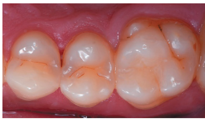
2. Final situation 2 weeks after the filling. Great comfort and no sensitivity at all were reported by the patient.