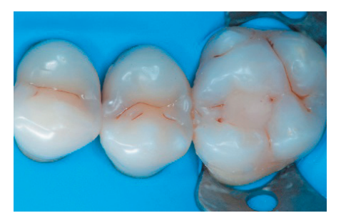
1. The situation after rubber dam isolation.