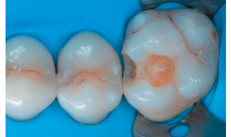
3. Class II cavity prepared.