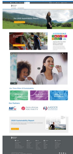
Fig. 2: Dentsply Sirona's new Sustainability Hub.