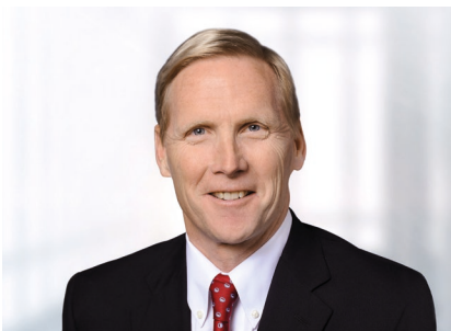
Fig 3: Don Casey, CEO of Dentsply Sirona.