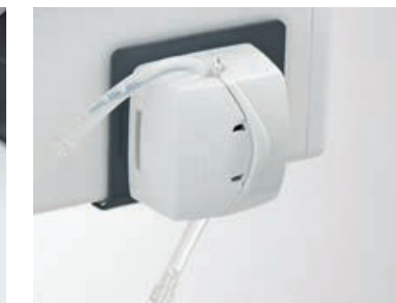
Integrated pump for saline solution