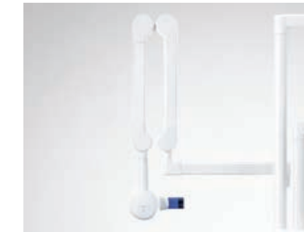
Heliodent Plus model