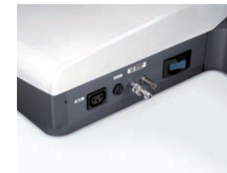
External device connection