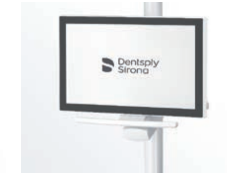
22" monitor on the light support column