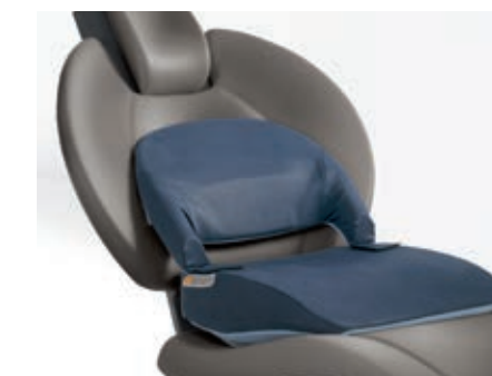
Booster cushion for small patients