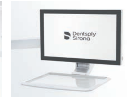
22" monitor on the tray