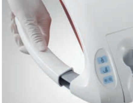
Elements can be thermally disinfected

The swiveling cuspidor can be removed for easy cleaning.