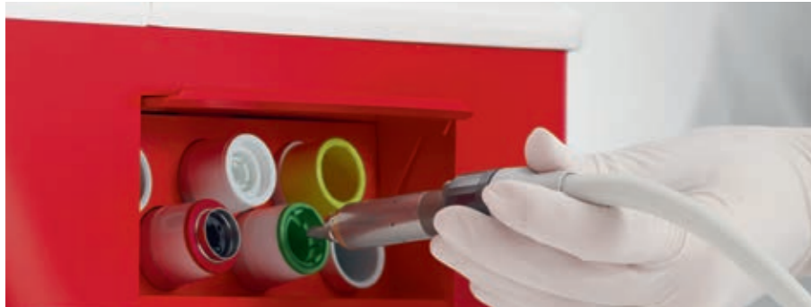
Integrated sanitization adapter

Sinius gives you the highest hygiene standards and efficient use of time. From the smooth, easy-to-clean surfaces to the easily detachable components and integrated sanitization adapter, everything is geared to easy, time-saving handling and the elimination of potential sources of contamination.