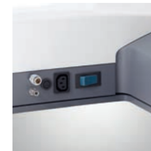
External device connection