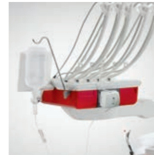
Integrated pump for saline solution