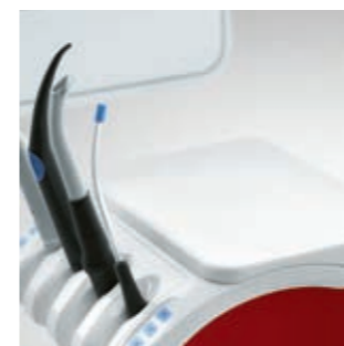
Additional tray for assistant element (silicone mat)