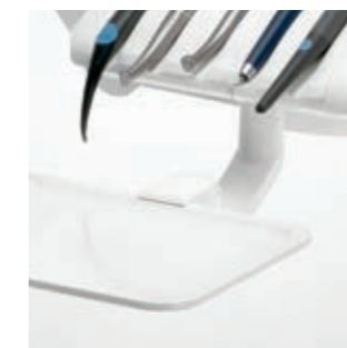
Swiveling tray holder (for Sinius CS)