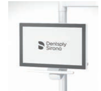
22" monitor on the light support frame