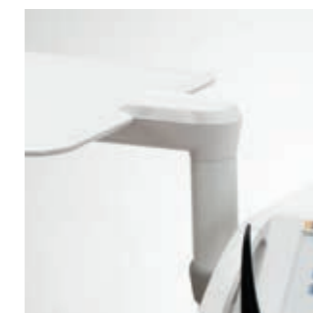
Swiveling tray (for Sinius TS)