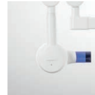
Heliodont Plus model