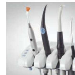
Satelec mini LED curing light holder