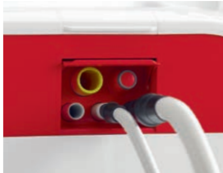
Efficient suction hose cleaning

For regular flushing of the water systems and monthly sanitization, you can simply connect your instrument hoses to the integrated sanitization adapters and with the press of a button you have optimal water quality.