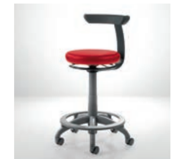
Carl Manual Plus