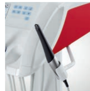
SiroCam AF+ in the additional holder