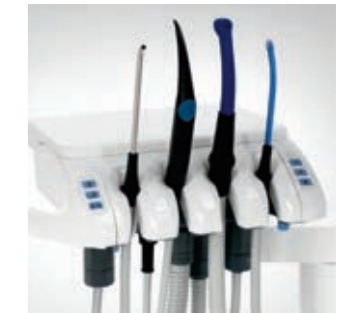
Surgical suction device