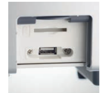
USB interface in the dentist element