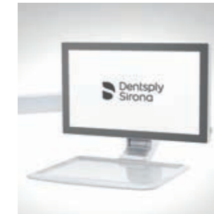
22" monitor on tray