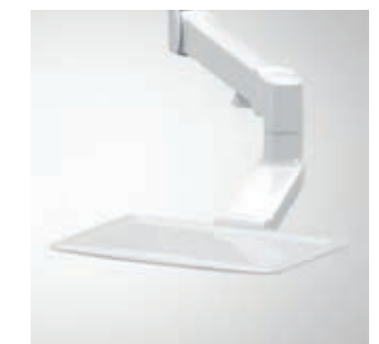
Sirona tray (for Sinius)