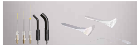
EasyTips and MultiTips: Sterile disposable fibers and therapy light guides for various applications