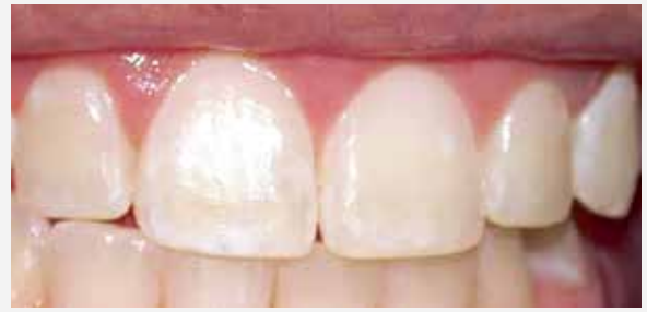
4 weeks later