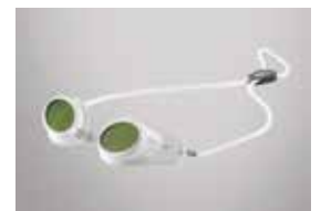
Laser safety goggles for patients