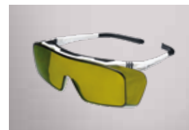
Laser safety goggles for users