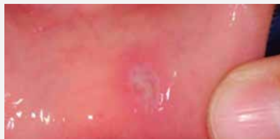
1 week later