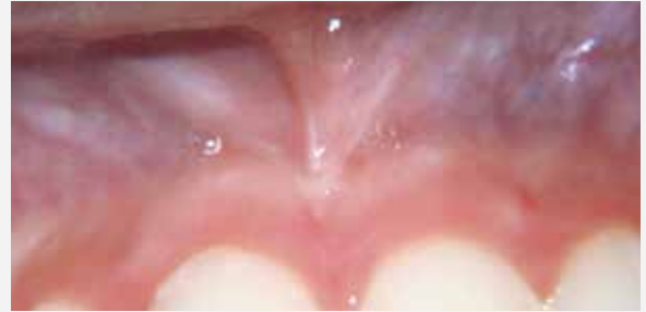
4 weeks later