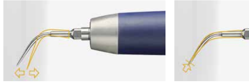
Up - down and forwards - backwards. The two-dimensional oscillation of the tip acts gently on the tooth being treated.

A great combination: The ideal result - regardless of the type of treatment - depends on the ideal combination of scaler and tip. By optimally matching the two components, Dentsply Sirona ensures consistent high quality. This has produced ultrasonic scalers that are flexible and easy to use with a selection of tips designed to be used in specific treatment areas.