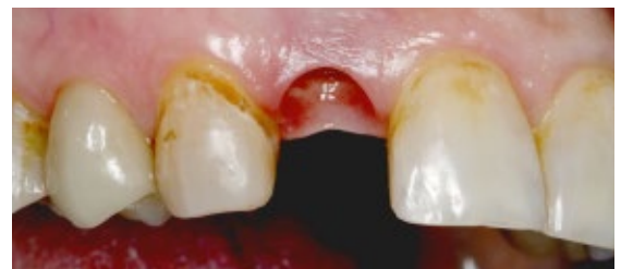
1a. Customized healing abutment contours the emergence profile

The Atlantis healing abutment is designed with the same emergence profile as the final Atlantis abutment