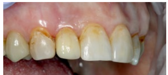
1b. Enabling an esthetic final result