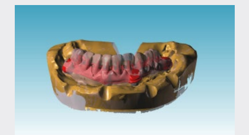
CAD design of the suprastructure in Atlantis Viewer, for approval prior to milling.