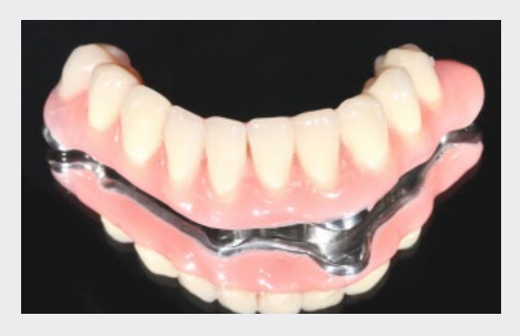
Secondary structure of an Atlantis 2in1 designed as a hybrid, finished with prefabricated teeth and denture resin.