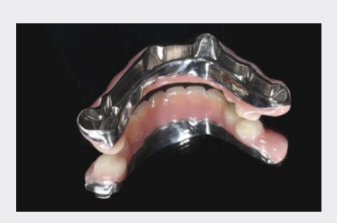
Secondary structure of an Atlantis 2in1 is designed to be attached to the primary using friction fit.