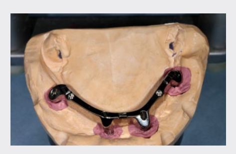
Primary structure of an Atlantis 2in1 is designed as a bar to be fixed to implants.