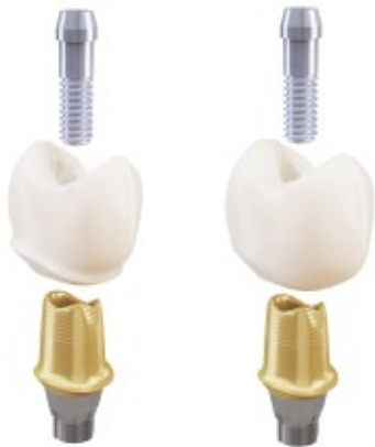
Cut-back crown in zirconia or full-contour crown in zirconia with screw access hole.