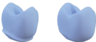
Cut-back crown file or full-contour crown file with screw access hole.