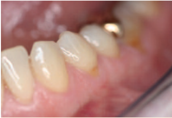
Fig. 2: First premolar with exposed dentin.

means that inflammatory processes of the tooth pulp also play an important role. Nevertheless, the existence of bacteria is not the primary factor. 14