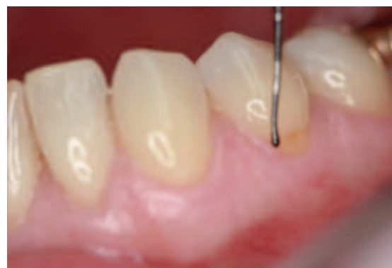
Fig. 3: Tactile stimulation with a WHO periodontal probe.

No side effects in the respective treatment situations have been observed up to now.