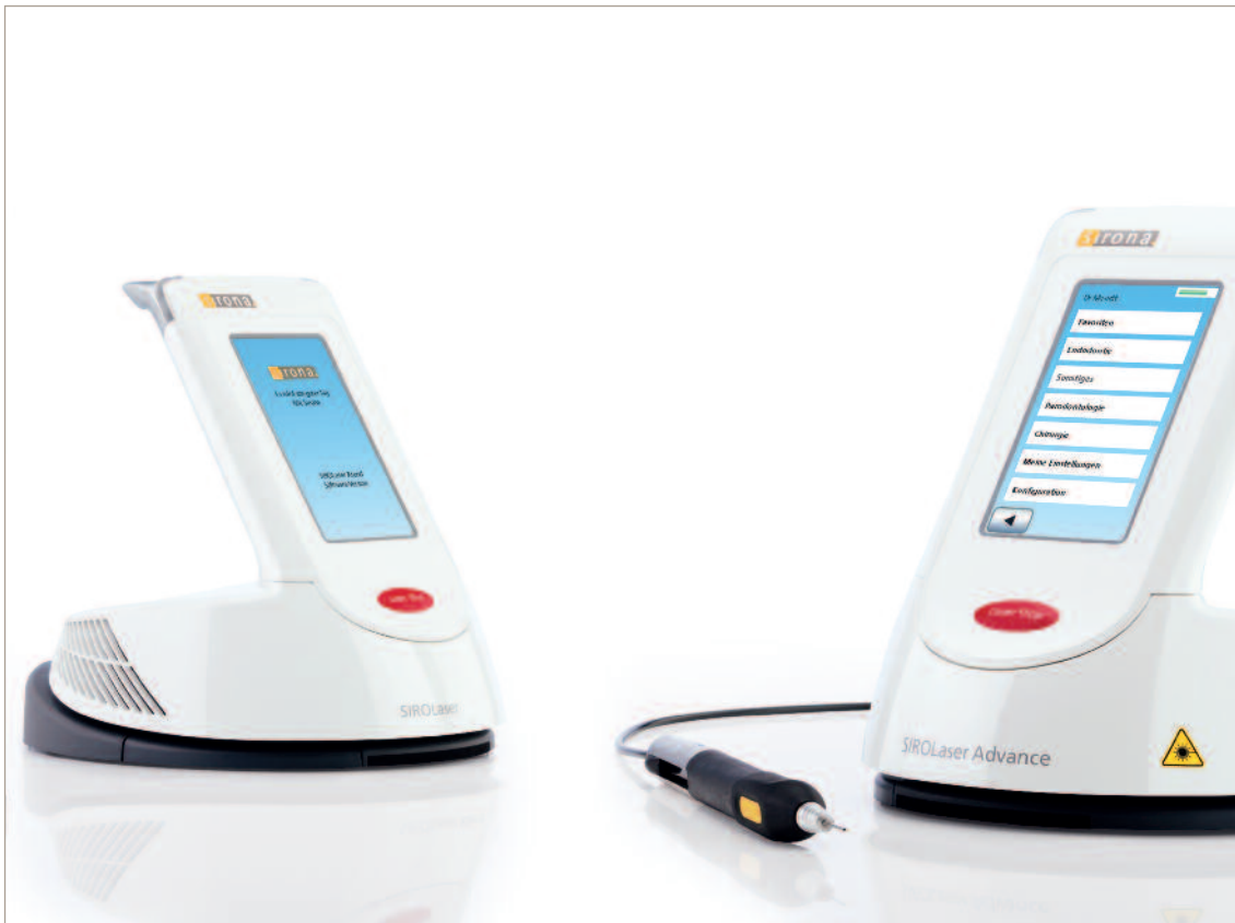
Fig. 1: SIROLaser Xtend and SIROLaser Advance.

pulp. Amputation of the coronal pulp is often performed with diamond instruments under water cooling. Along with formocresol as a pulpotomy medicament, which is a potential mutagen 6 , electrosurgical devices 7 , ferrous sulfate 8 and lasers are also used due to their hemostatic effect. The first applications of laser in pulpotomies were with the CO 2 9 , Nd:YAG 10 and Er:YAG lasers 11 . The 980 nm diode laser was also the subject of a randomized split mouth study by Saltzman et al. 12 , in which a conventional formocresol-zinc oxide eugenol pulpotomy was compared to a diode laser pulpotomy with mineral trioxide aggregate (MTA). The study showed that in a 15-month observation period both methods were equivalent.